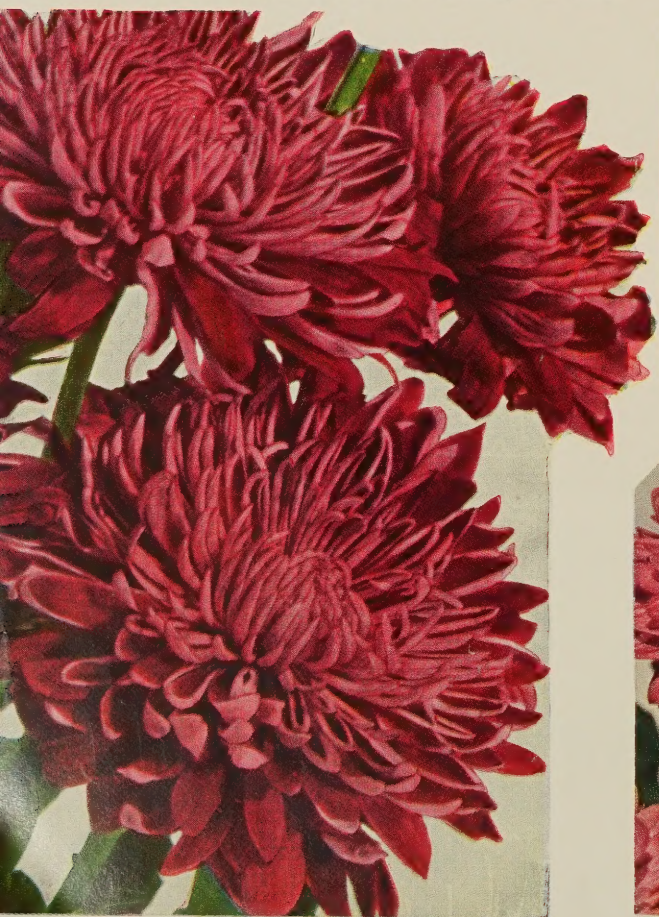
CHIPPEWA. 50c each; 3 for $1.25

7 Earliest MUMS All bloom in late August and early September 7 Sure-to-Bloom Plants $3.25 (1 of each pictured)